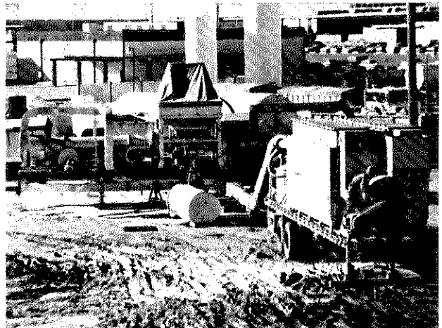
Typical portable perlite expanding plant.

There are many different design concepts for low temperature and cryogenic storage vessels. However, most are of double wall construction with the annulus filled with expanded perlite. Packaged or bulk perlite may be used to insulate smaller vessels by pouring or blowing the insulation in place. Portable perlite expansion plants are usually used to insulate storage tanks, cold boxes, ships, and other double wall vessels and pipes. In these applications perlite ore is expanded on-site and the expanded perlite insulation is conveyed pneumatically into the annulus.