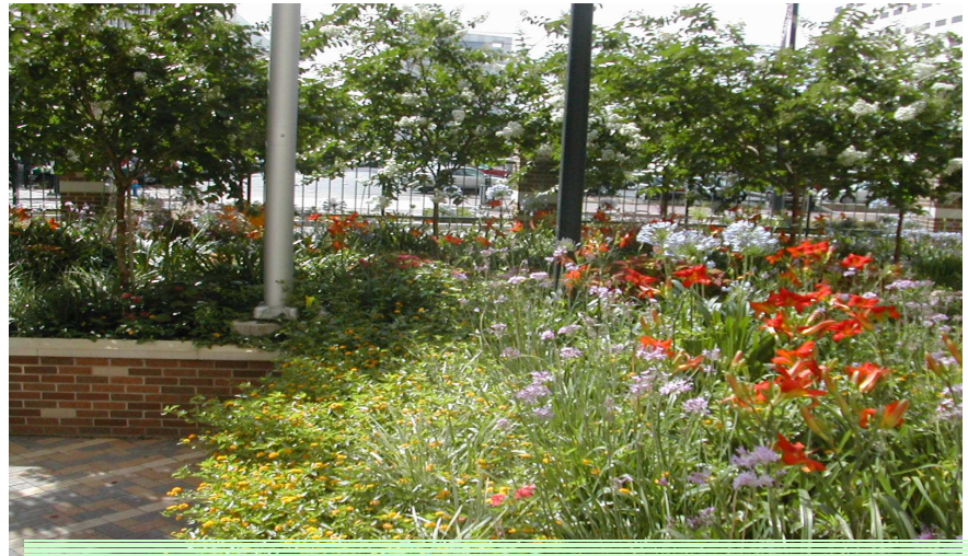
Marriot Hotel Parking Garage (Humble Oil Building) Houston, Texas